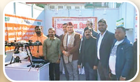
Hon'ble Chief Minister Shri Pushkar Singh Dhama, along with other senior officials, visited the agriculture drone stall set up under the 'Viksit Bharat Sankalp Yatra' in Kapkot Block, Bageshwar District, Uttarakhand State.