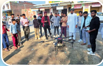
The Hon'ble Union Minister of State for Defence & Tourism, GOI, Shri Ajay Bhatt, graced the drone demonstration program under the 'Viksit Bharat Sankalp Yatra', along with other dignitaries from various departments at village Dheemar Khera, Block Kashipur, in District U.S. Nagar, Uttarakhand State.