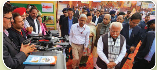
Hon'ble Chief Minister of Haryana State, Shri Manohar Lal Khattar, during the 'Viksit Bharat Sankalp Yatra', visited the drone demonstration stall and discussed its applications in agriculture at Fatehpur Billoch Village, Faridabad District.

National Farmer Day was celebrated during the 'Viksit Bharat Sankalp Yatra' at village Nagla Aimad, Haridwar.