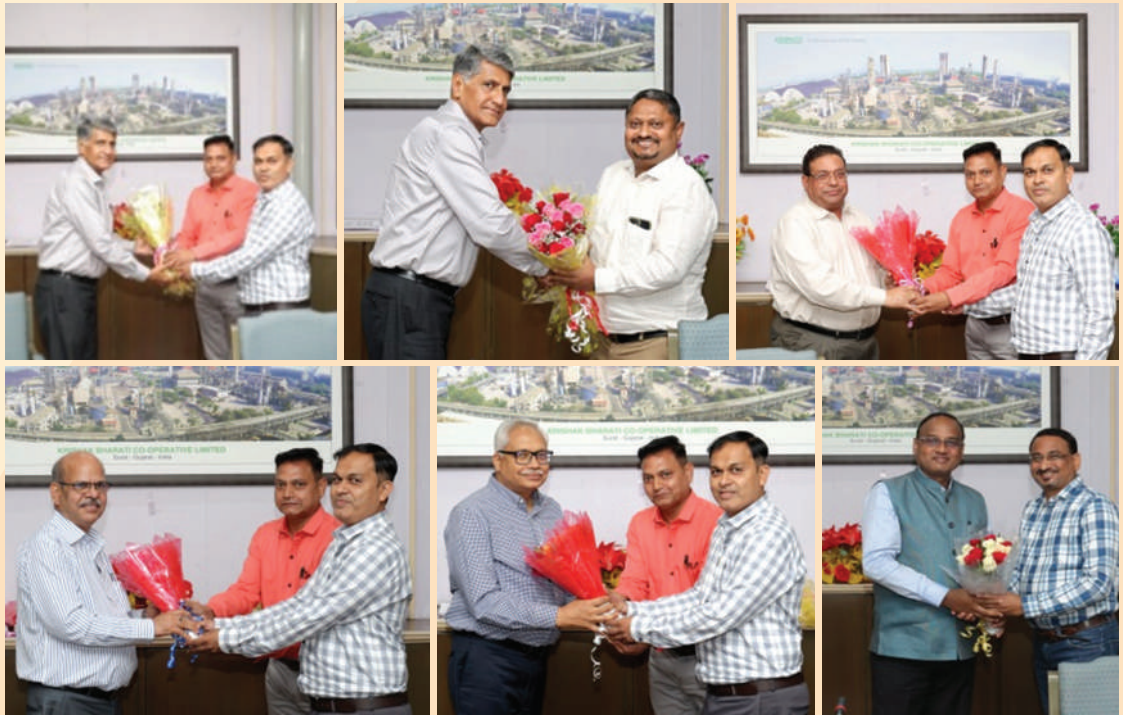
Welcome by representatives of KRIBHCO Officers' Association and KRIBHCO Karmachari Sangh