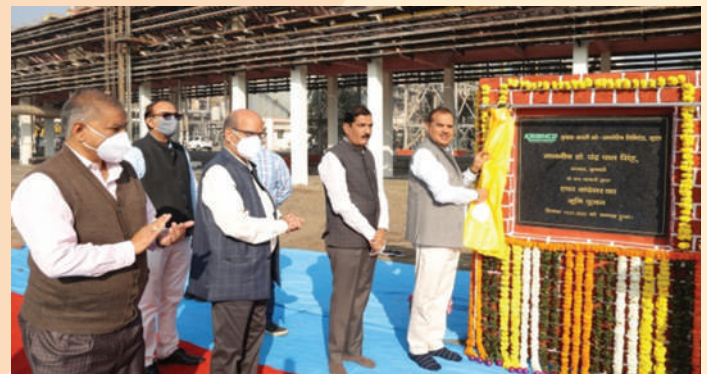
Foundation Stone laying for Air Compressor