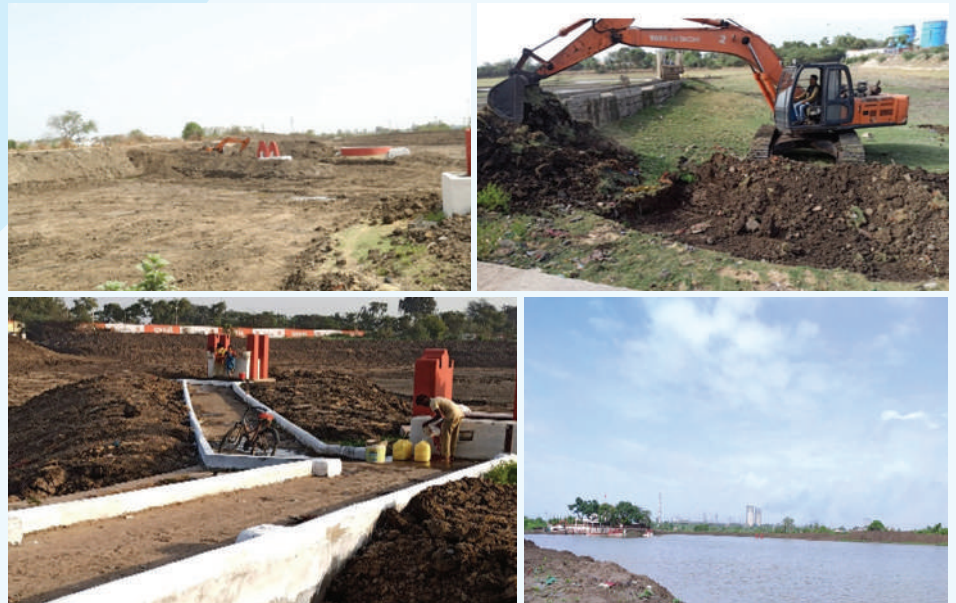
After Completion of Works