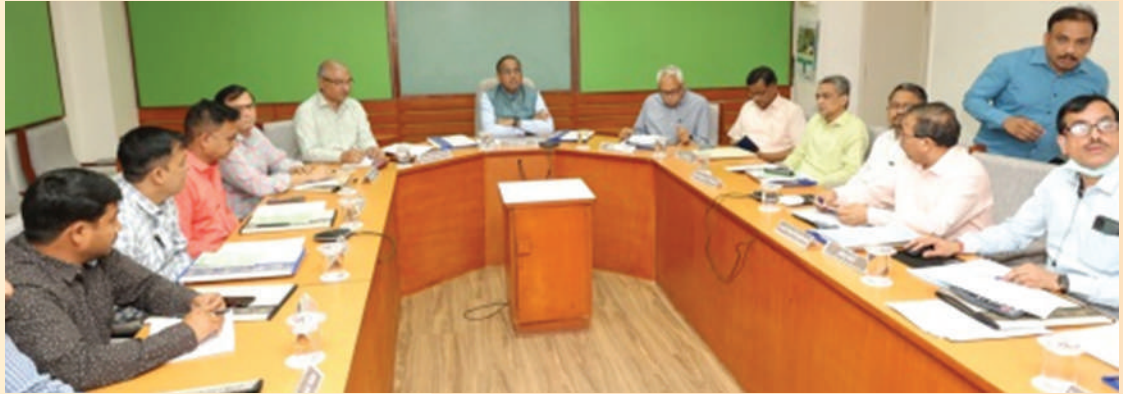
Meeting with Senior Officials in Board Room