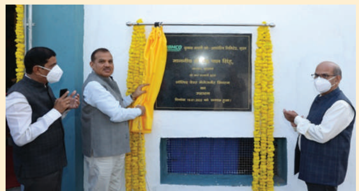
Dedication of Energy Conservation Scheme to the Nation