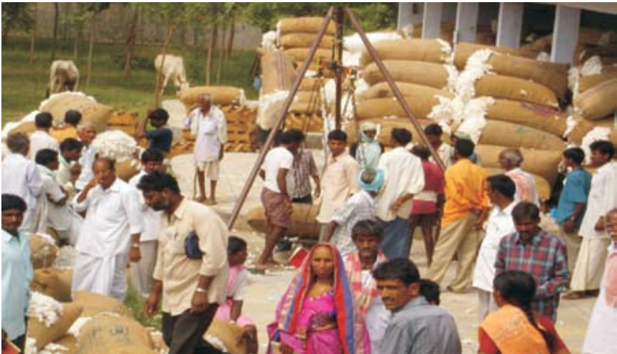
Cotton collection and storage from the members

Large farmers left many lands fallow, medium and small farmers could not invest in farm development even if they wanted to, mainly because finance which was available would have been at such a cost that the fruits of labour or the additional investment would never have been theirs. Laborers migrated to neighboring states in search of work.