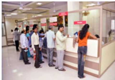
A view of public dealing counter of the bank

Professional approach, absence of vested interests, well trained staff and directors, transparency, discipline in the work, efficient customer service, capacity to visualise future and to take right decision and no politics in the board itself and customer's faith are the hallmarks of the bank. Bhagini Nivedita Sahakari Bank believes that women have inherent and latent capacities in them, which have to be channelized properly and effectively to attain the desired goal.