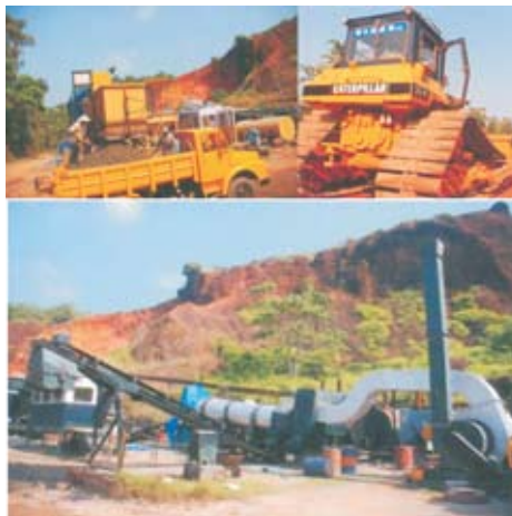
Society uses its own equipment and machinery for various construction works

Another important virtue of the society lies in its freedom, which the workers enjoy in arranging the details for the execution of the work without employer's supervision, except by inspection by them at completion of each successive task, to ensure that the work is being carried out to specification. ULCCS Ltd. is a successful model of an LCC in the country. The Society generally takes up works in State of Kerala, well before participating in the tender, the committee members assemble to decide upon the percentage with which the society can take up the work. In many instances, after tender, negotiations happen, which is again vested with the Governing members to take decisions. In some situations the work might be awarded without floating tenders. The society also takes up works, which need to be completed on war footing. After earnings a work, the various tasks are identified and are assigned to various Directors. Leaders, who require materials for works, allocate construction machineries and allot works for members and nonmember workers succeed each Director.