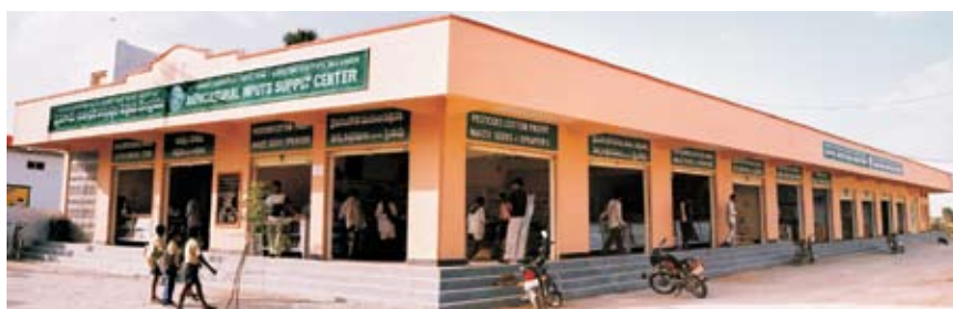
Agricultural Inputs Supply Centre of the society

Computerization:- All the affairs of the society have been computerized with the cost of Rs. 125 Lakhs and all the accounts have been integrated reducing the work load considerably.