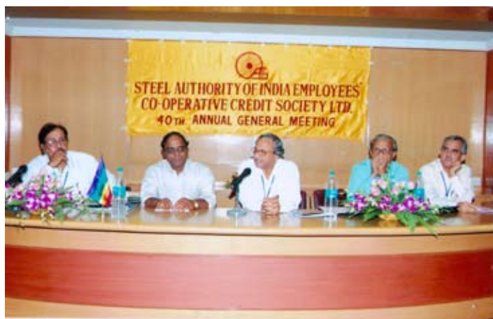
Annual General Body Meeting of SAIL Employees Cooperative Credit Society Ltd.

The area of operation of the Society are the offices of Central Marketing Organization and other Central Units of Steel Authority of India Limited located all over the country.