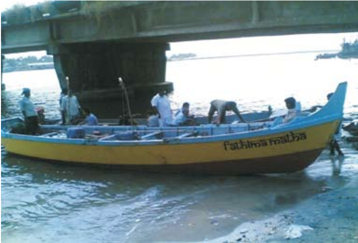
Introduce diesel Out Board Motors (OBMs) to their members