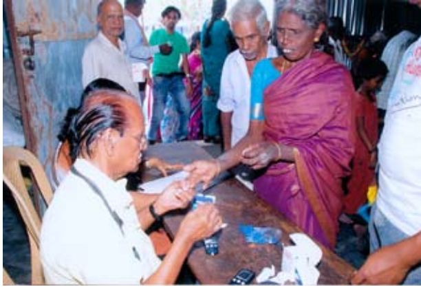
Free Health Check up camp organised by the Society