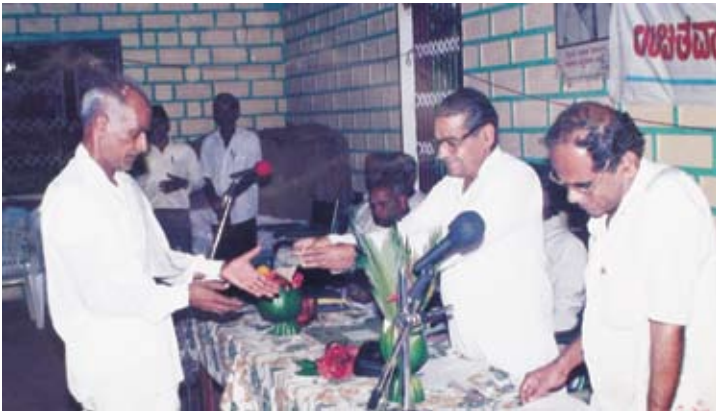
Organisation of camp for free vegetable seeds distribution to the members