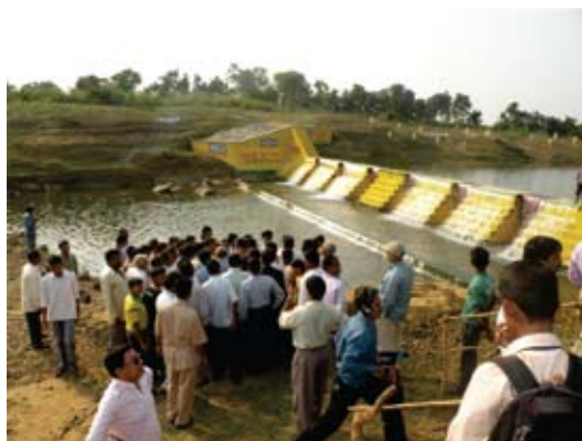
Bankura check dam- IFFCO's initiative

IFFCO for the last over four decades has been engaged in production and distribution of fertilisers along with providing services on agricultural, social and community front to the farmers and cooperatives throughout the country. It exhibited commendable overall performance especially