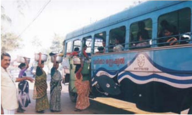
Marketing of fish by fisherwomen through its own transportation of Matsyafed

Kerala Sustainable Urban Development Project (KSUDP): It is a joint venture project of Matsyafed with KSUDP which envisages the livelihood improvement of fishermen community.