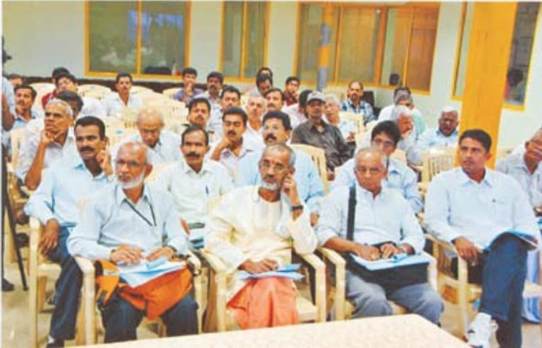
Member actively participating in the Seminar of the society

than 85 percent of the area under cultivation is made up of small and marginal holdings.