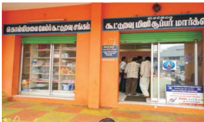
Cooperative Mini Super Market of Kollimalai LAMPS