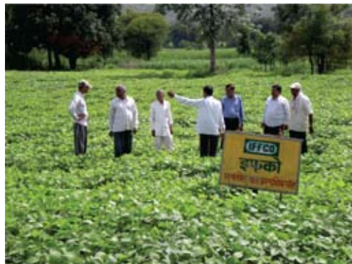
Demonstration Plot on Balanced Fertiliser Use

Keeping in view the success achieved as a result of measures undertaken in Bighapur pilot project, IFFCO stepped up its initiative to expand soil rejuvenation and crop productivity enhancement related work through its “SAVE THE SOIL” campaign in 2010-11 throughout the country and thereafter in more than 600 villages. Combination of different activities related to project were implemented in different States viz. 11848 compost pits produced about 12,000 MT compost for soil application. 459 biogas plants were also installed. Cultivation of green manures dhaincha , sun hemp, green gram etc on an area of 17077 ha benefitting 41532 farmers leading to average enhancement in yield of about 15 percent in succeeding rice, maize and wheat besides relative saving in Nitrogen application in the form of urea. 12,185 MT phospho gypsum/gypsum was supplied for reclamation of alkali soils and 251 MT lime for reclamation of acid soils covering 2476 ha in 10 States and recorded average yield increase of 15-65 percent in crops like paddy, wheat, mustard etc. after soil reclamation. 94 water storage tanks were developed in states of Himachal Pradesh, Madhya Pradesh and Rajasthan. In addition, 37 water bodies were desilted and renovation of ponds/wells was carried out in Odisha Rajasthan and Tamil Nadu. Further, five units of rain water harvesting were created in Karnataka, five units of lift irrigation in Jharkhand, Bihar and Odisha: and 41 units