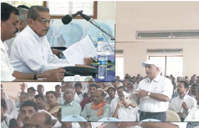
Annual General Body Meeting of the Society