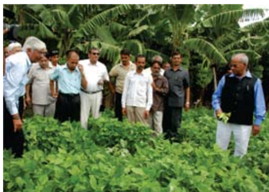
Soil Rejuvenation project ,Bhigapur (UP)

IFFCO has implemented area specific agricultural development projects to extend benefit of technology to the farmers through demonstration approach and to bring about overall development in the area. This