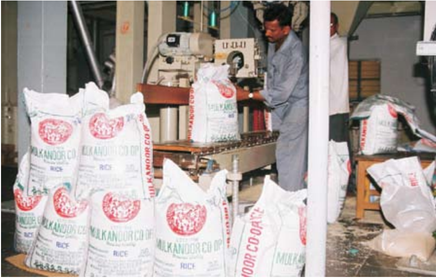
Rice packaging centre of the society

Marketing Services: While the supply of credit and other inputs helps members to increase production, it is only through the processing and marketing of their produce that a significant increase in financial returns can be expected.