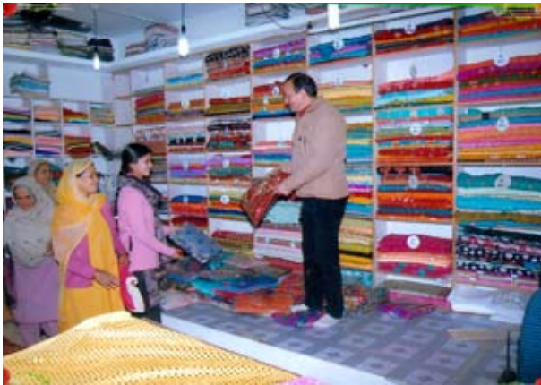
l gdljh l Hk dh di Ms dh nqlu

सभा 1985 से पहले केवल ऋण व बचत का ही काम करती थी। अपना भवन बन जाने के बाद सभा ने अपने सदस्यों की आवश्यकता को मध्य नजर रखते हुए खादों का व अनियंत्रित वस्तुओं का कारोबार शुरू किया व उसके बाद क्योंकि लोगों को पीडीएस का सामान लेने के लिए दूर-दूर जाना पड़ता था इसलिए पीडीएस का लाईसेन्स लेकर पीडीएस का काम 1986 में शुरू किया व किसानों के लिए उत्तम किस्म के बीज व खादों का काम शुरू किया। 1985 में ही लोगों की मांग को मध्य नजर रखते हुए सभा ने छोटे स्तर पर कपड़े का काम शुरू किया लेकिन धीरे-धीरे काम बढ़ता गया व 1985 से लेकर आज तक सभा हर प्रकार के कपड़े का काम