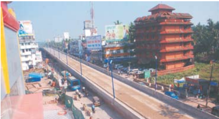
Construction of Flyover in the Kozikode city by labour contract cooperative Society

The Uralungal Coolie Velakkarude Paraspara Sahaya Sangham, formed during 1925, is renamed as The Uralungal Labour Contract Cooperative Society and registered under Societies Act in 1967, with its headquarters in Madapally in Vatakara Taluk in Kozhikode District. The Society undertakes civil construction work in Infrastructure development in North