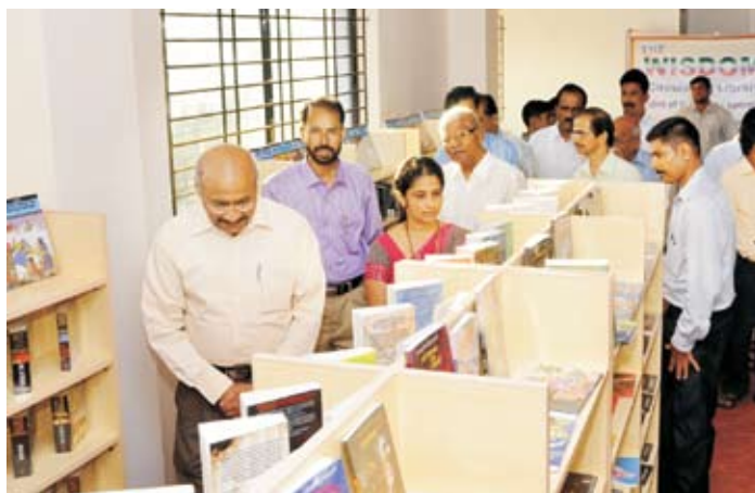
Promotional activities for running a library by the society

institution. The college is having excellent infrastructural facility in a sprawling campus of about 3 acres of land.