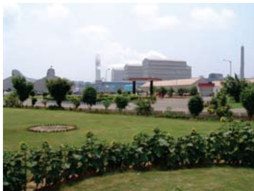
NPK,DAP Complex in Paradeep, Odisha

IFFCO has been instrumental in promoting innovative farm technologies for the farmers of the country. The initiatives encompass the society's vision of rural empowerment through agriculture with member cooperatives as the pioneer service providers. Agriculture has been the