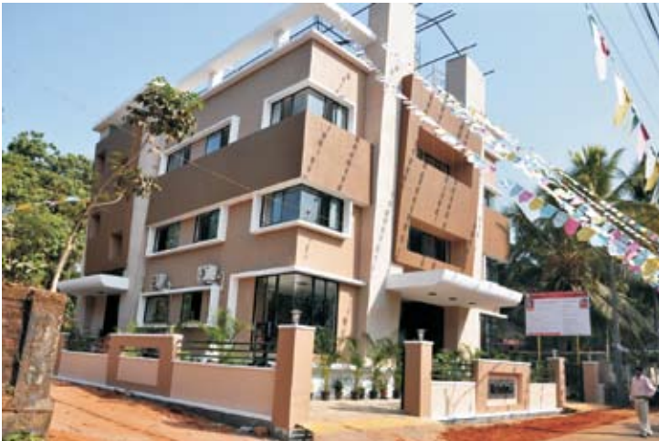
Main Building of GIC