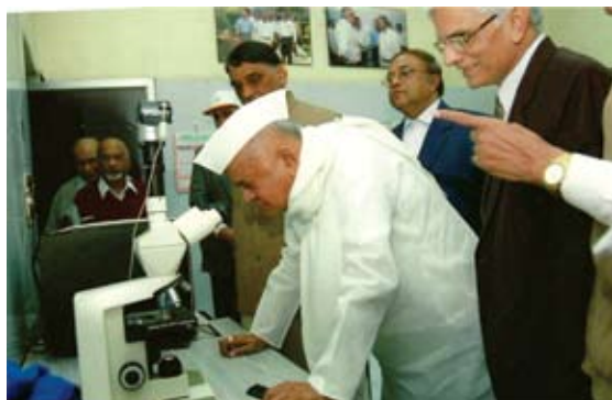
IFFCO Chairman in CORDET lab

IFFCO has tried through farm mechanization a model of development