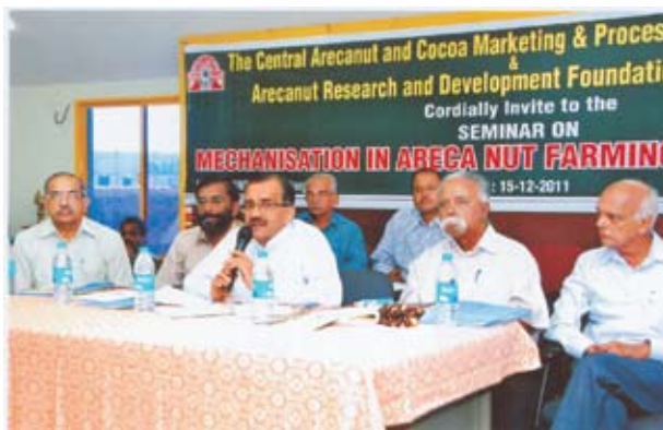
Seminar organised by CAMPCO on Mechanisation in Areca Nut Farming

Its objective is to procure arecanut, cocoa and rubber from its members and arrange for its sale to the best advantage of members and manufacture of cocoa based chocolates and other products.