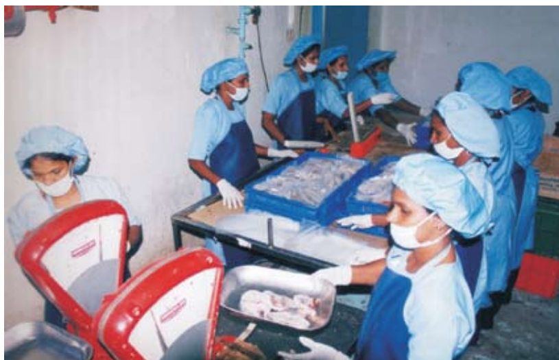
Matsyafed Ice & Freezing Plant at Kochi