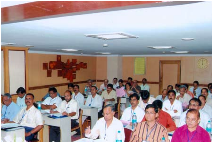
Members attending the Annual General Meeting of the Society