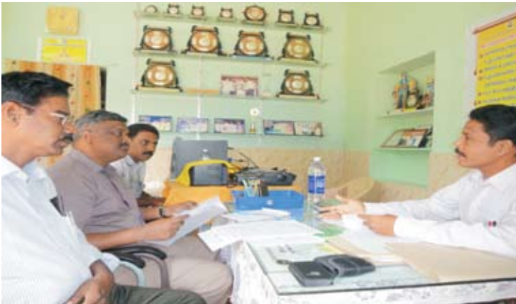
Researchers discussing with the Secretary of the LAMPS

LAMPS became the helping hand to the scheduled caste and scheduled tribe people living in hills and forest areas. The objectives of the societies are to provide short term loans at concessional rates of interest, to offer medium term loans for purchase of cattle and minor irrigation purposes, to supply agricultural inputs, to provide marketing facilities and infrastructure for minor forest produce collected by the tribal members, to distribute the essential and other consumers goods and to promote thrift, self-help and mutual help among the members. Thus, they are the