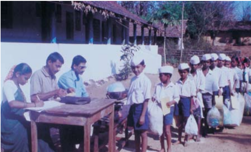
Society organise Waste Plastic Collection programme for clean environment