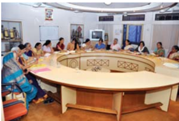
Participation of women members of the board meeting of the bank

In the initial stages BNCB had to face a lot of challenges in respect of mobilising share capital and deposits. Devotion of directors like Mrs.