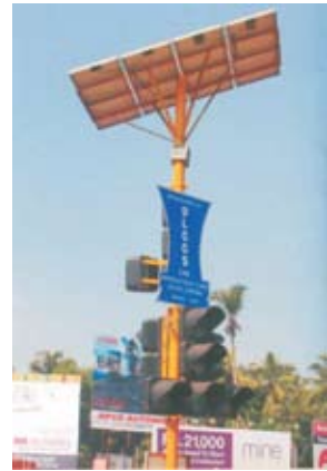
Installation solar traffic light system by the society

Also in 1965, when the work amount exceeded the tender amount, the Kerala Government allotted 10% weightage, which is marked as the first allowances from the Government side. This was a part of the initial step encouragement from Kerala Government to Labour Contract Society to sustain which delivering quality works, by competing with private contractors was a tough task, possible only with the proper back up from the Government. The Government has always supported the society by relaxing the limits of executing works, from time to time through special Government Orders. Now the society can take up the work without